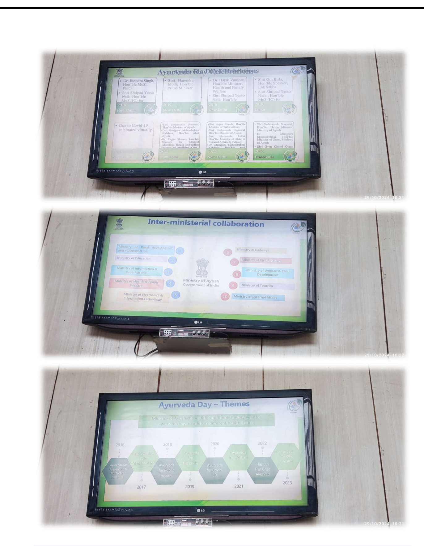
Ayurveda Day e-kit was displayed to beneficiaries in the waiting area.